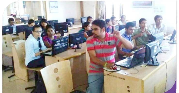
BHGCET Students taking the lead to create a world of better designers