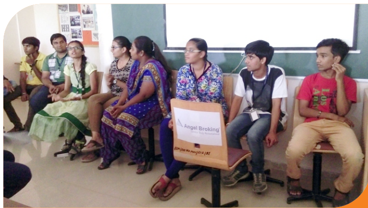
Focused team players

In elimination phase, test was taken which included MCQ and Short questions. Thereafter, from each class top 15 students who got highest marks were filtered to form each team. During the checking of papers there was a round for engaging the audience, Fin Silk Quest. By applying the rules of "High Risk and High Return", the students earned chocolates as per the difficulty level of questions. That was really a fun plus learning quest.