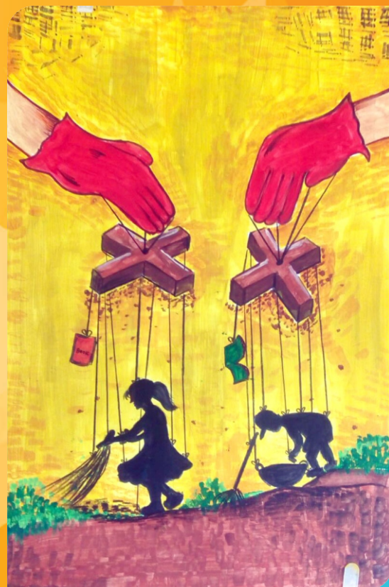
Painting on child labour