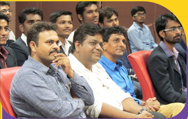
What is success but these 3 smiles is our success