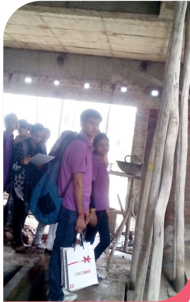
Observing formwork of building