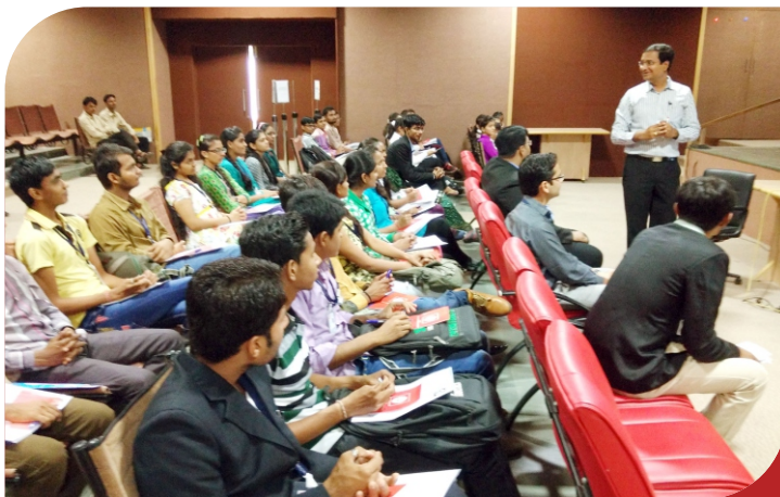
Key note speaker