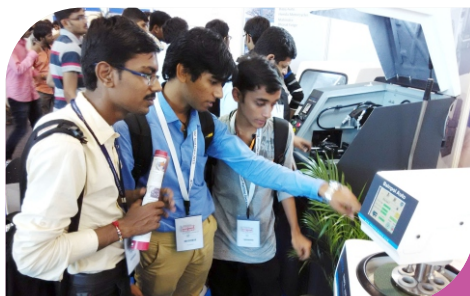
Exploring the future technologies