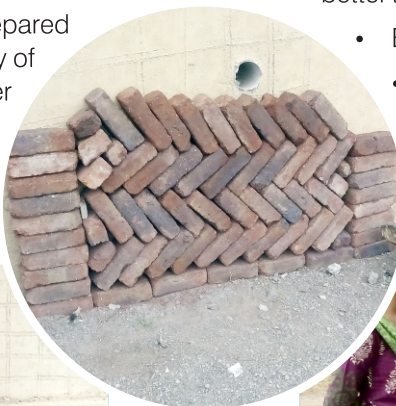
Zig-zag brick bond