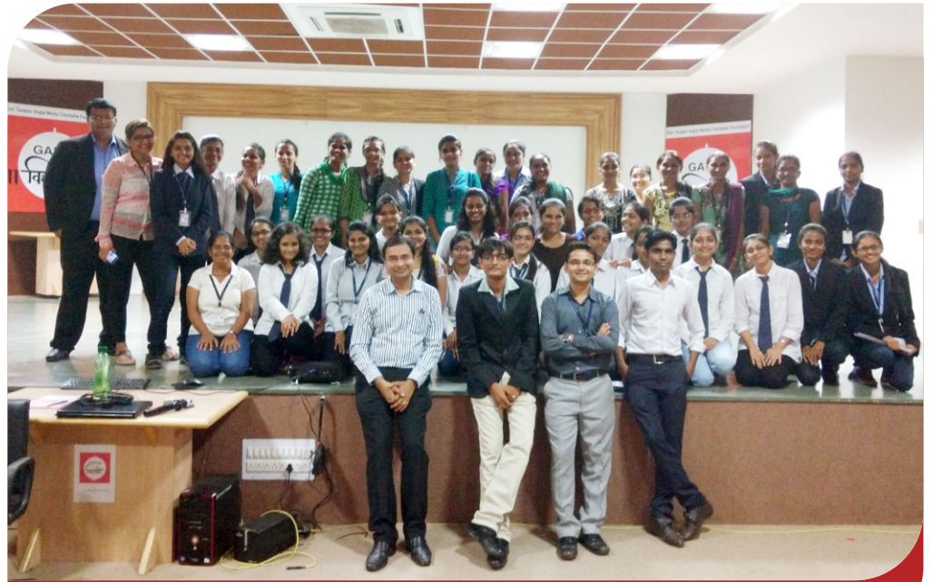
The team of Novices and Educators