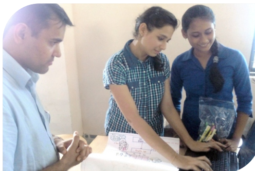
Faculties having a glimpse of Steganography models designed by 5thSem students