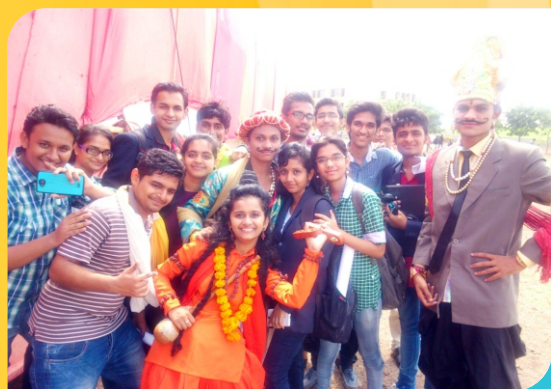
Team of One Act Play - Techno Yumlog

BHGCET has always taken adverse situations as opportunities to nurture the development of the students, which aided students to give their best within minimal time and with determined practice. With the combined efforts of whole team, they displayed exceptional team work, unity and prodigious performances.