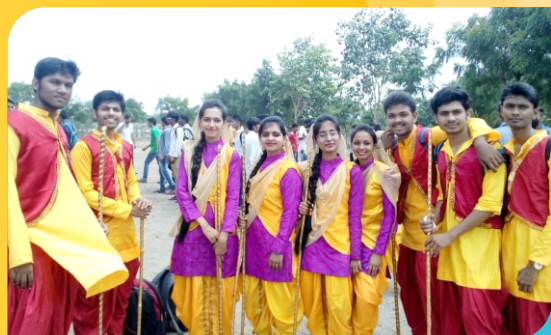
Gujju gardians ready for punjabi folk