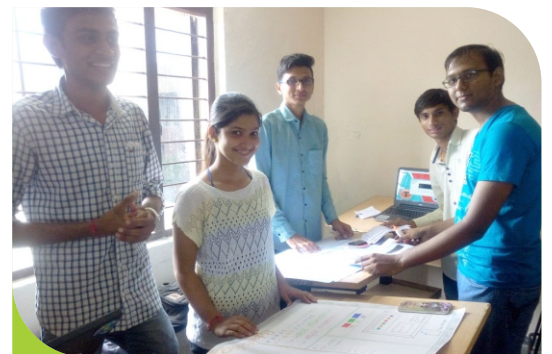
Sharing and enjoying their own efforts put into effect during the Exhibition