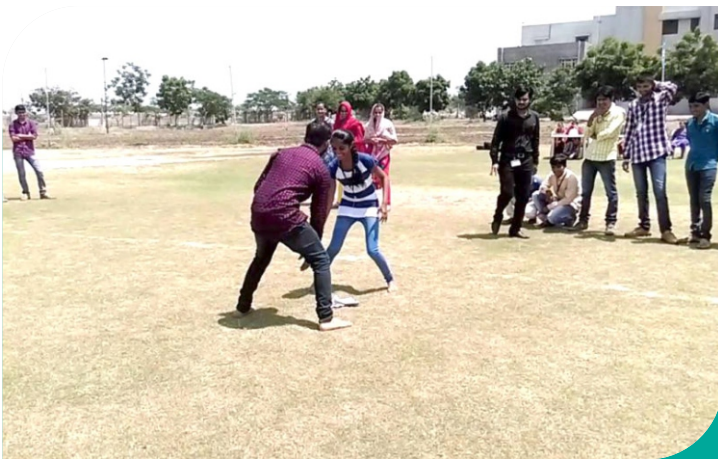
Fun filled competition

Considering the same, the day of 9/9/15 was celebrated as an innovative Wednesday; a session was kept as a sport hour. The whole session was planned and conducted by the Students of MBA- I. In this event they arranged few games in which partakers had to use their mind more than the body.