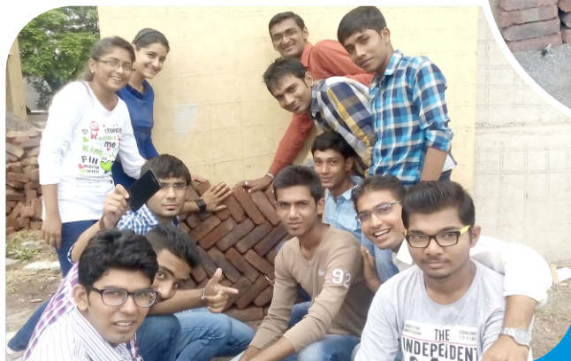
Organized brick bond