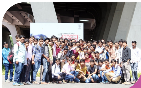
Students visited Machine Tool Expo at Gandhinagar