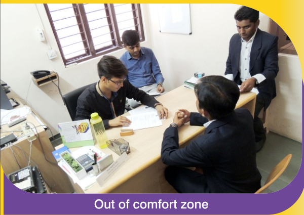
Out of comfort zone