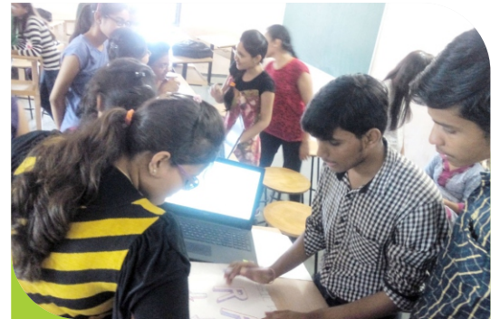
Let me show you my way of Coding...