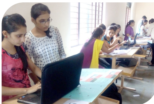
Technocrats at their best in showcasing their implementation on the Steganography theme