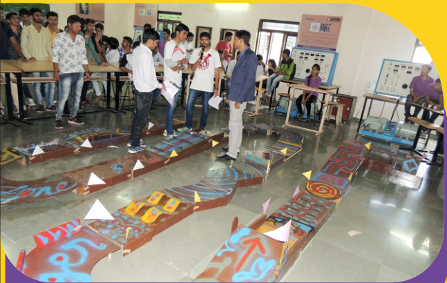
Obstacle's chain - Robolan