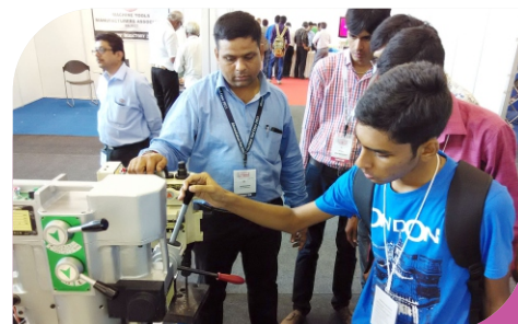
Hands on experience on tapping technology