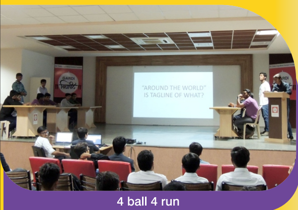
4 ball 4 run