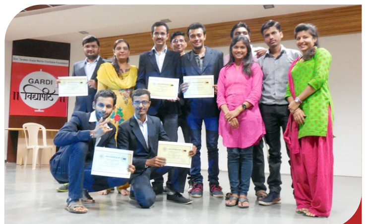
The contented faces of the Coordinators behind the event along with the Judges.