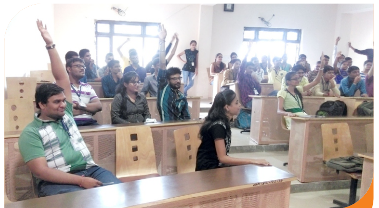
Curious to crack