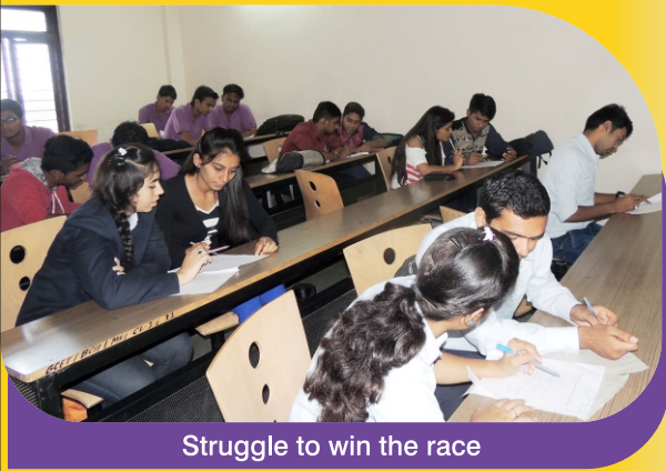
Struggle to win the race