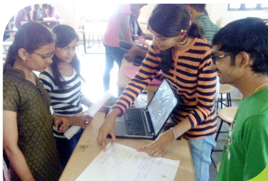
Showcasing of ideas through poster & also Ideas put into action through coding.