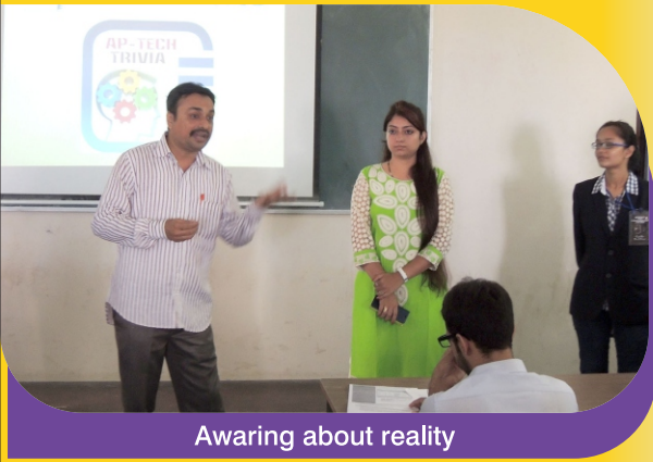
Awaring about reality