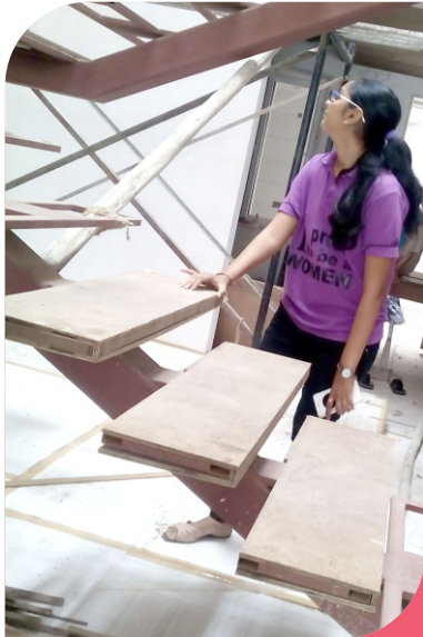
Observing form-work of steel stair case construction

The ever growing, updating with the innovative thinking concept to bring enthusiastic way of learning to engineering subjects, the civil department of B.H. Gardi College of Engineering and Technology arranged the visit for 3rd semester civil engineering students. They visited Building Construction site at 150 feet ring road