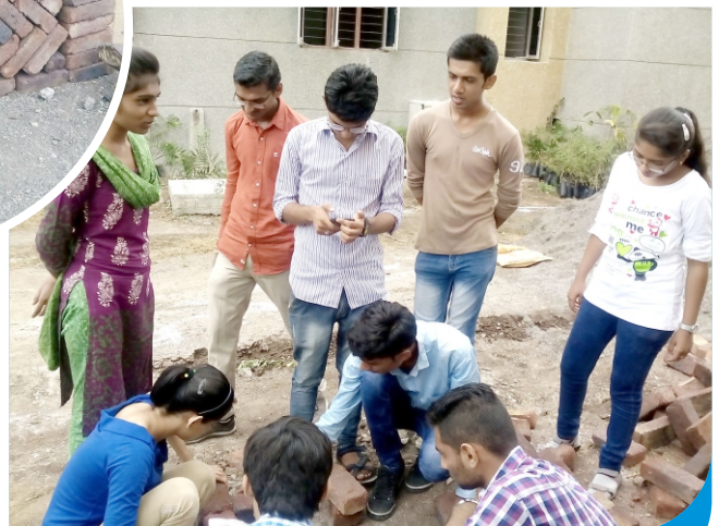
Directing the students