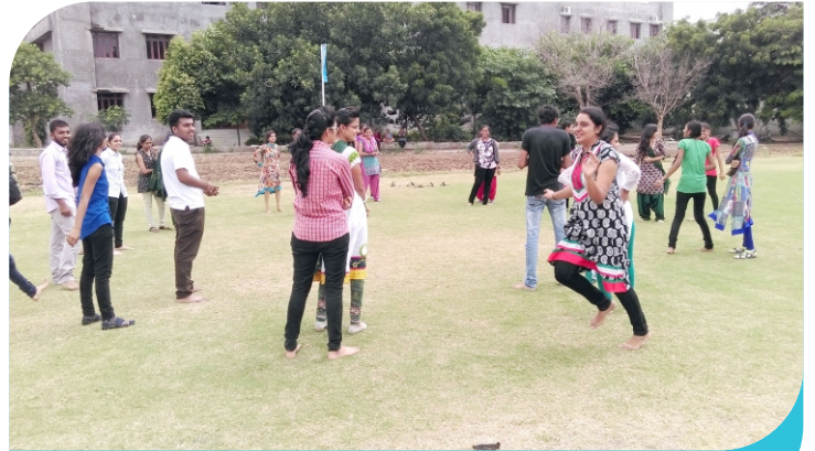
Fun time after celebration

From this competition, the HUMAN RESOURCE CLUB wants to