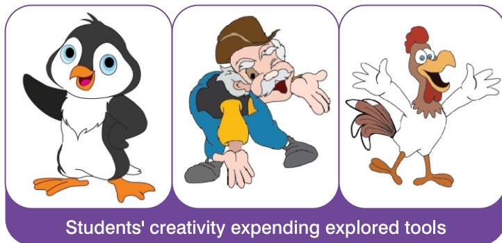
Students' creativity expending explored tools