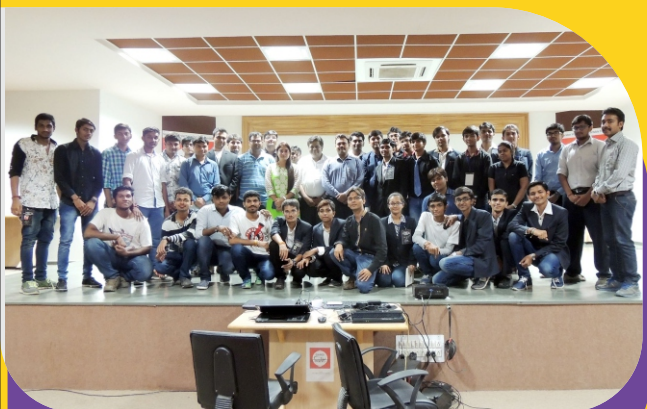
Finally fruitfully ignited elektrikos 4.0

Electrical Department of B. H. Gardi College of Engineering and Technology, was proud to bring to you the Fourth edition, ELECTRIKOS-4.0'15 - a Rajkot region Level Technical Event organized on 15 September 2015. ELECTRIKOS-4.0 gave a platform to the students to y their new and innovative ideas into the real sense. ELECTRIKOS-4.0 stands for the endeavour to appreciate intellect and give budding technocrats a feel of real-time man made wonders; vouches yet again to be an enthralling experience. ELECTRIKOS-4.0 provided a platform to interact with the best minds, displayed the marvel of modern is technology to the youth. The objective of this ELECTRIKOS-4.0 was to bring to the students common platform to interact and share their innovative ideas, knowledge and to highlight new concepts in variety of technologies.