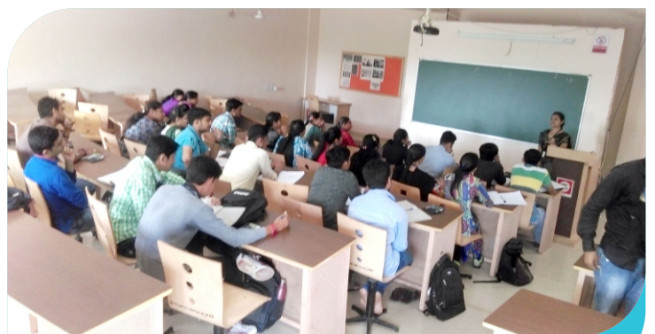
Teaching the teachers