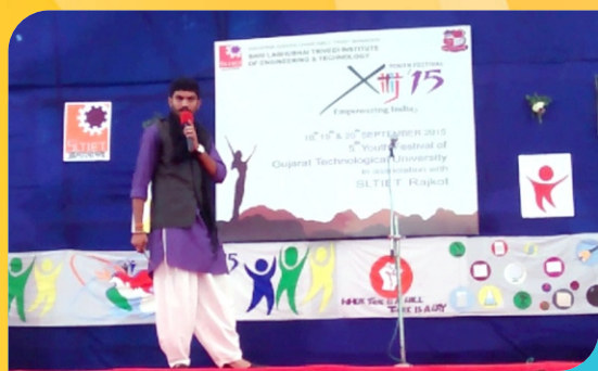
Mimicry champ of Gardi