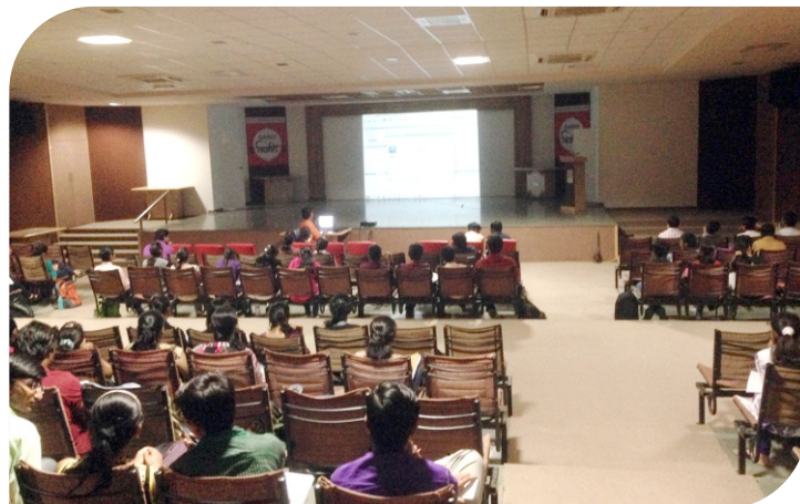
Focused mind power is one of the strongest forces on earth !!